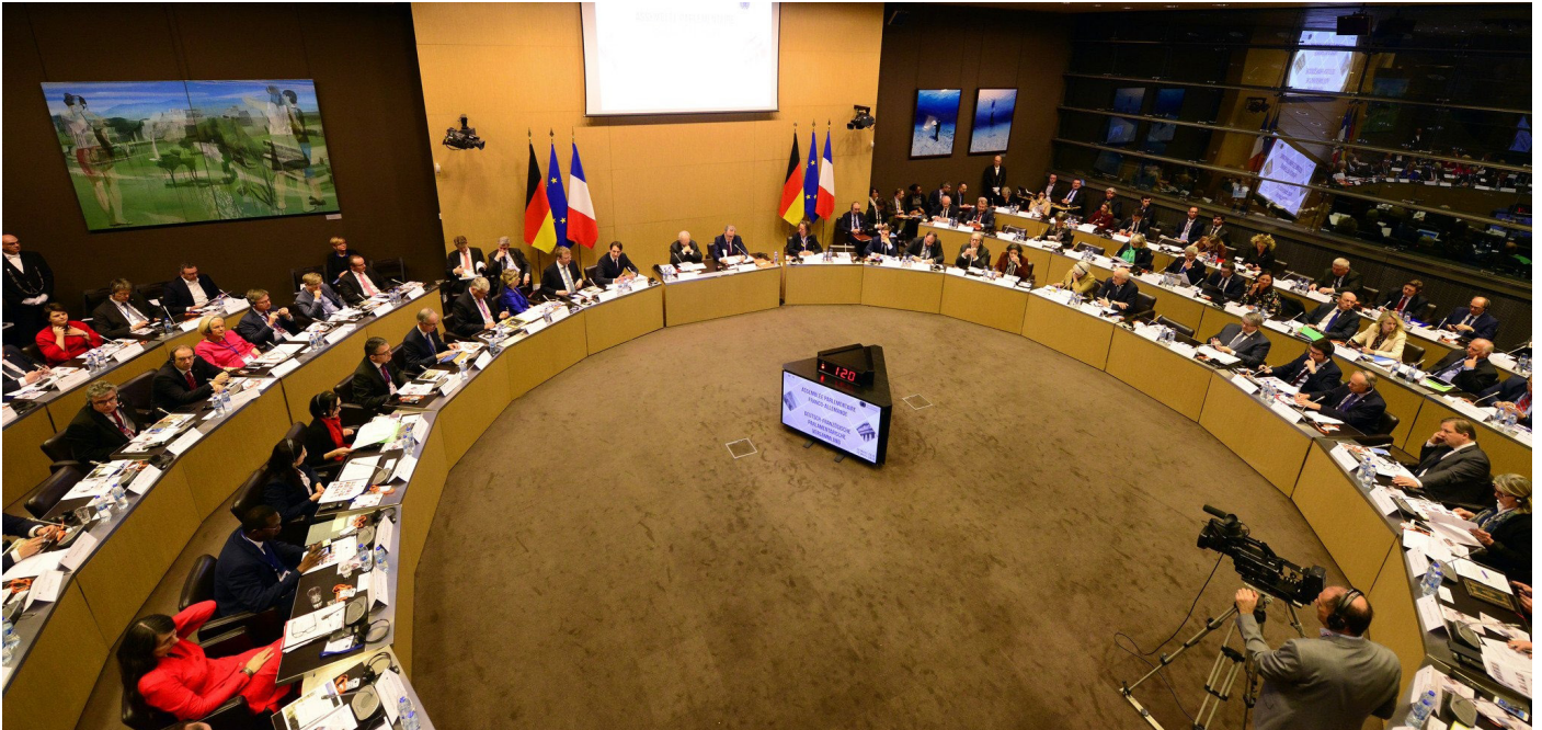
The first meeting of the Franco-German Parliamentary Assembly and the ticking clock taking center stage

On March 25, the Franco-German Parliamentary Assembly met in Paris for the first time. Richard Ferrand, the president of France's National Assembly called it a "historic day." This new institution has received little media attention, but it is the result of an unprecedented collaboration between two parliaments at the heart of the European project. If administered innovatively, it could set a precedent in the field of interparliamentary dialogue in Europe, showcasing how the future of cooperation can count on other champions than governments.