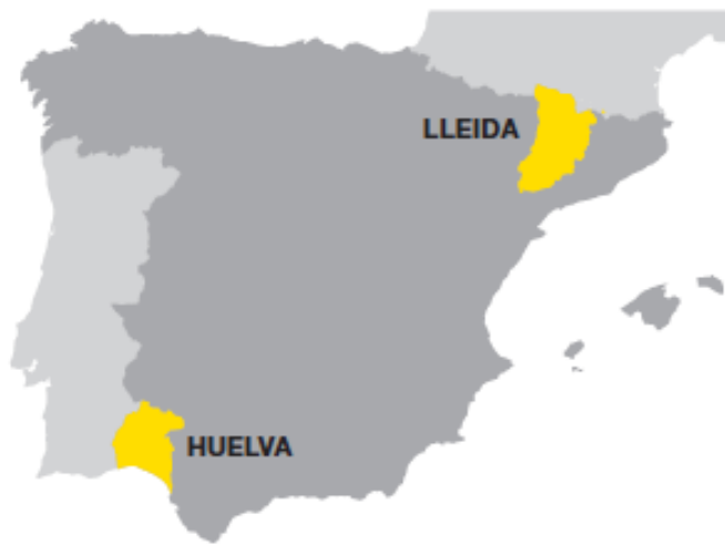
Map 1: Provinces of Lleida and Huelva within Spain

The enclaves of Huelva and Lleida are the most significant in Spain in terms of temporary workers' schemes. This is not only because they have historically employed the majority of foreign seasonal workers within the country, but also because they have been regarded a model of reference by the EU, as recognised in the Directive 2014/36/UE related to the conditions of entry of seasonal workers mainly linked to agriculture (Molinero and Avallone, 2018). As the following map shows, Lleida is a province of Catalonia in the north of Spain, whereas the province of Huelva is located in the south-west side of Andalusia next to the border with Portugal.