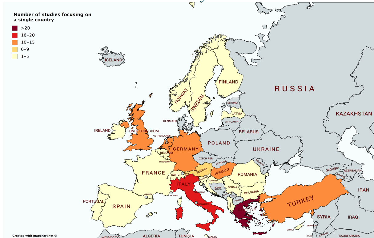
Figure 3: Geographical focus of relevant studies that looked at single countries

Notably, most of this recent attention was focussed on countries along the major routes of travel used by asylum seekers and refugees since 2015, as well as some of the main destination countries. A particular concentration can be noticed in those countries that were most directly affected by, or themselves involved in, the apparent failure of the CEAS, i.e. Greece, and to a lesser degree Italy, as well as Hungary and Germany; while Turkey has been the major focus beyond the EU's external borders.