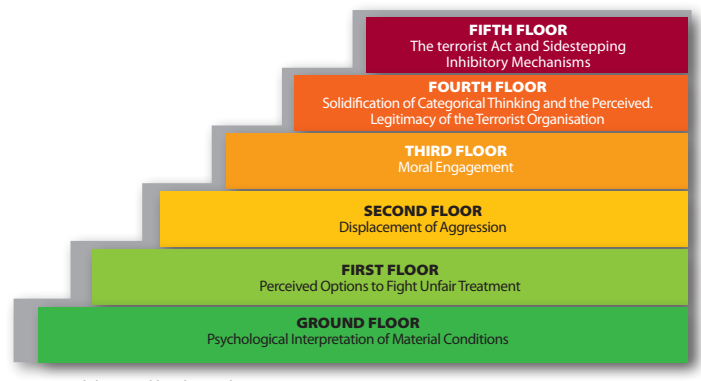
Figure 3: The staircase to terrorism

A more sophisticated model is provided by Georgetown University psychology professor Fathali M. Moghaddam (2005), who developed the "Staircase to Terrorism" as a metaphor for the process of violent radicalisation. Moghaddam's metaphor is of a staircase housed in a building where everyone lives on the ground floor, but where an increasingly small number of people ascend to the higher floors, and very few reach the top of the building. The "staircase" narrows as it ascends from the ground floor and fewer and fewer people reach each of the five successive floors.