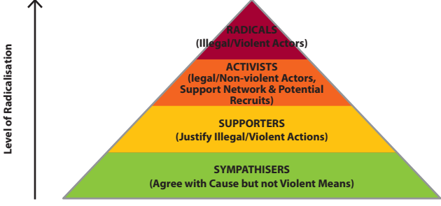
Figure 4: The pyramid model of radicalisation

Finally, the most elaborate visualisation is provided by the so-called Pyramid Model of Political Radicalisation where the higher levels of the pyramid are associated with increased commitment but decreased numbers are involved. As Figure 4 indicates, the apex of the pyramid represents the small number of active terrorists who remain relatively few in number when considered in relation to all those who may sympathise with their beliefs and feelings (e.g. superiority, injustice, distrust, vulnerability, etc.). The lower level of activists is composed of those who are not committing violent acts themselves, but provide those sitting at the top with tacit support (e.g. recruitment, political or financial support, etc.). The level below is made up of the far larger group of supporters who justify the goals the terrorists say they are fighting for but also, crucially, the violent means. The base of the pyramid is made of a far larger group of sympathisers who agree with the goals the terrorists say they are fighting for. This wider community of reference would constitute the social group the terrorist group is claiming to represent.