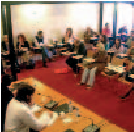
Intercultural citizenship: political participations and muslims

November 24-26. Department of Sociology, Istanbul Bilgi University, Istanbul