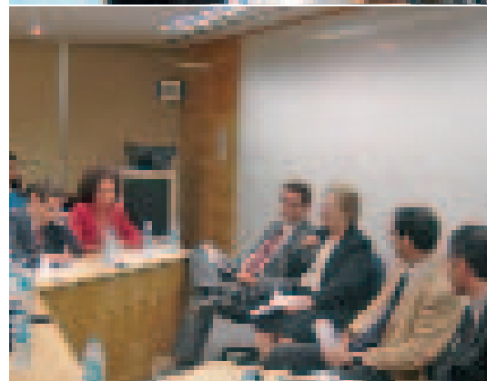
Democracy and Decentralisation in Latin America