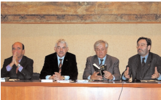
Agreement with Banco Santander Central Hispano › Emilio Botín, Pasqual Maragall, Joan Clos and Narcís Serra