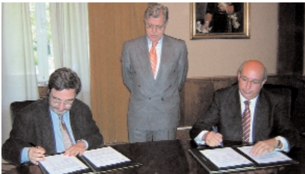
Agreement with the School of Diplomacy of the Ministry of Foreign Affairs and Cooperation ›