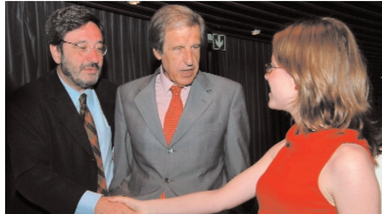
Agreement with Fundació Caixa Catalunya. Postgraduate scholarships for stays at the London School of Economics ›

The scholarship winners begin their studies in the 2004-2005 academic year.