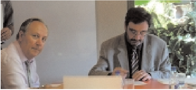
Agreement for the Yearbook of Immigration in Spain ›